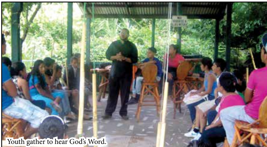
Youth gather to hear God's Word.

Youth Ministry Outreach in Central America: Congregations in Nicaragua and Costa Rica have started to focus on youth outreach and education in God's Word. One congregation promotes regular retreats for youth and another holds monthly worship services for youth.