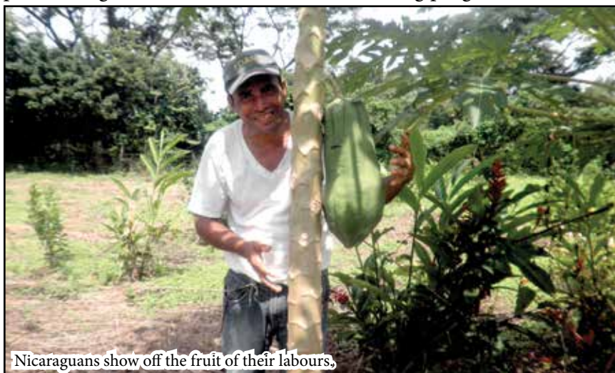
Nicaraguans show off the fruit of their labours.

Agricultural Projects: The property at LCC's Mission Centre in Chinandega, Nicaragua has been cultivated for farming, which both helps support LCC's mission in the country and provides for the needy in the region. A similar project is planned for Telica, and will provide vegetables for LCC's children's feeding programs.