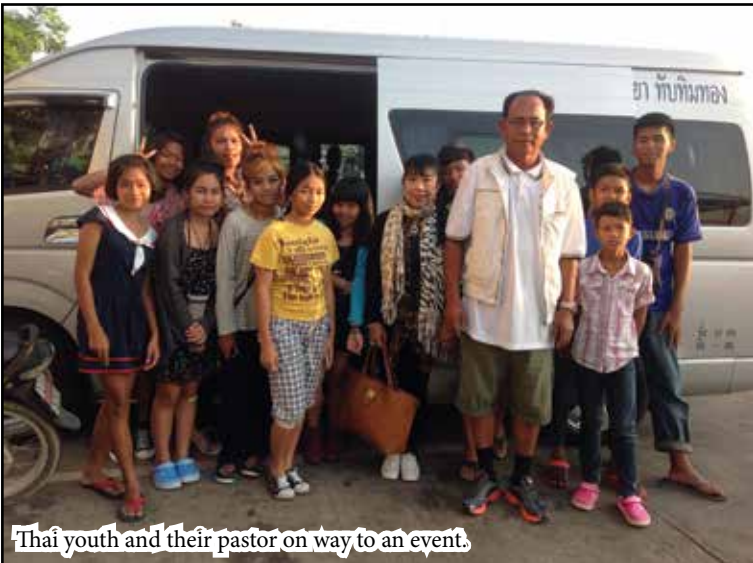
Thai youth and their pastor on way to an event.

All of Thailand's pastors and church workers.