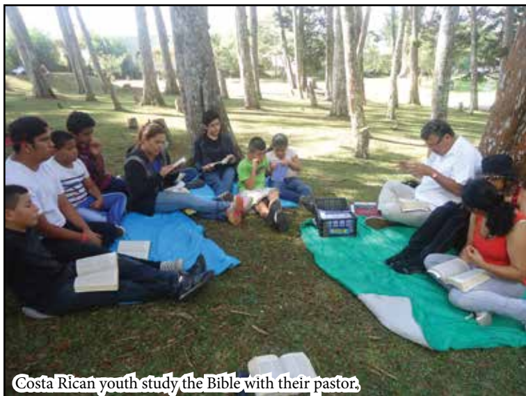
Costa Rican youth study the Bible with their pastor,