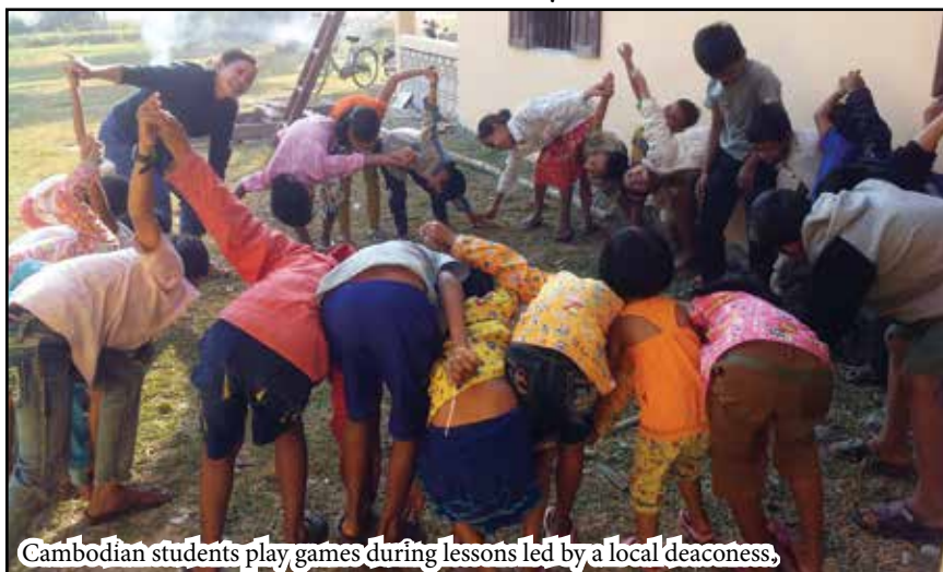
Cambodian students play games during lessons led by a local deaconess.

Children Education Program: In Cambodia, Thailand, and Central America, children are taught God's Word through children's education programs. In Nicaragua, LCC provides full-year scholarships along with basic needs like uniforms, shoes, and a backpack with school supplies. Deaconesses also tutor students in literacy and mathematics.