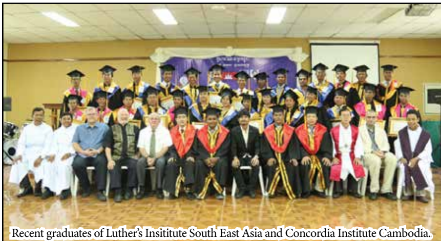
Recent graduates of Luther's Institute South East Asia and Concordia Institute Cambodia.

Education in Cambodia: LCC supports theological education in Cambodia. Luther's Institute South East Asia (LISA) provides education to pastors while Concordia Institute Cambodia (CIC) serves laypeople. In June 2015, 34 students graduated through LISA and 20 through CIC.