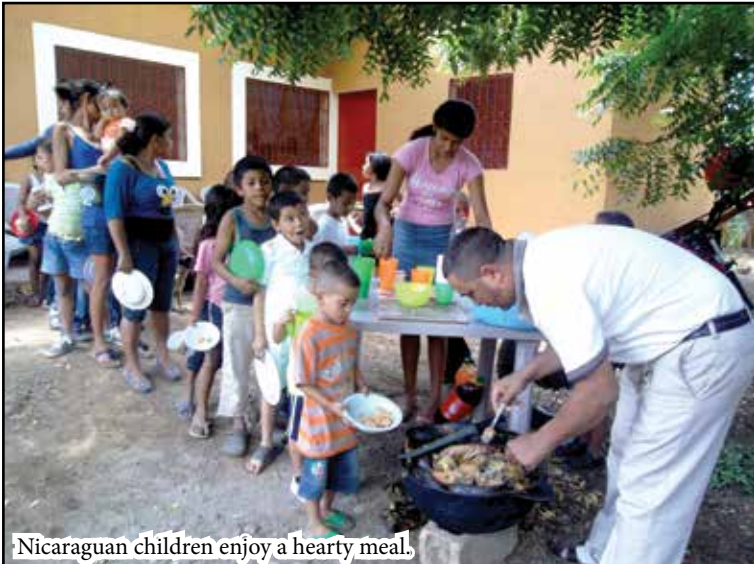
Nicaraguan children enjoy a hearty meal.