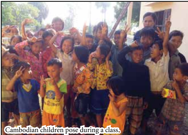
Cambodian children pose during a class.