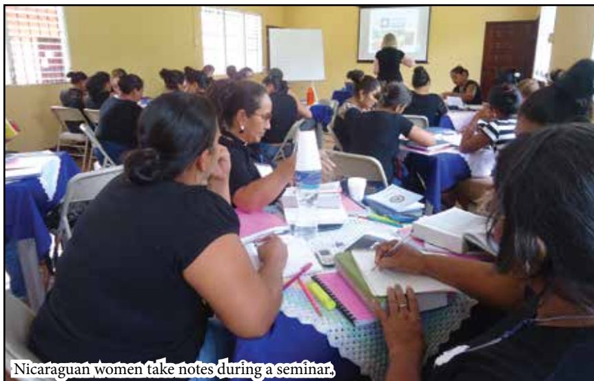
Nicaraguan women take notes during a seminar.

Sister to Sister Seminars: Lutheran Women's Missionary League-Canada has been involved in sponsoring deaconess education seminars since 2014, leading to greater knowledge of God's Word and closer fellowship between LCC women and international partners.