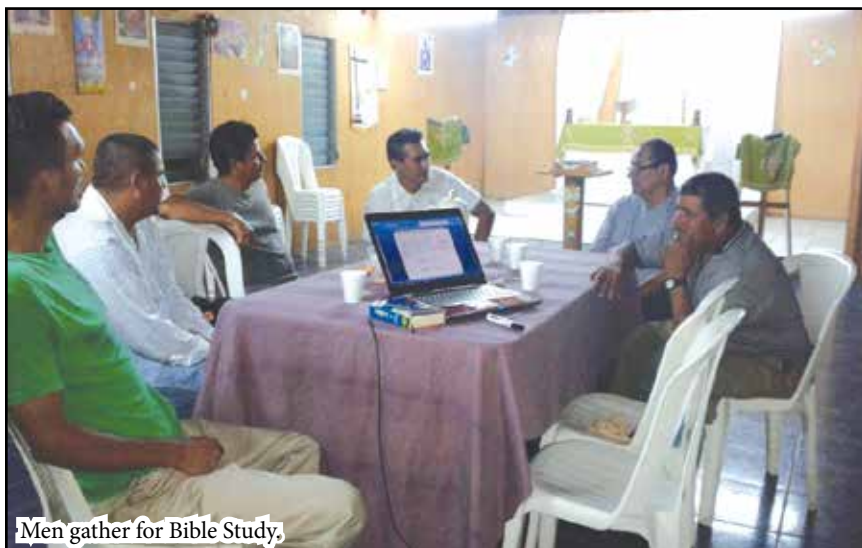
Men gather for Bible Study.

Men's Bible Studies: After making contacts with the families of children in the education program, a Nicaraguan pastor has started a men's Bible study group reaching out to men in the community with God's Word and home devotions.