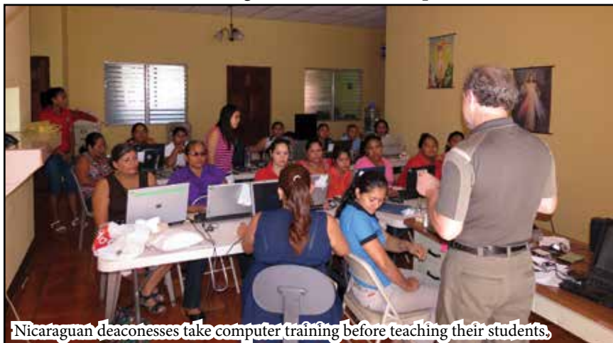
Nicaraguan deaconesses take computer training before teaching their students.

Computer Training Program: Throughout Nicaragua, children in the Christian Education Program are learning basic computer training from deaconesses. In fact, all 23 communities where LCC and its partner church are active are offering this education component.