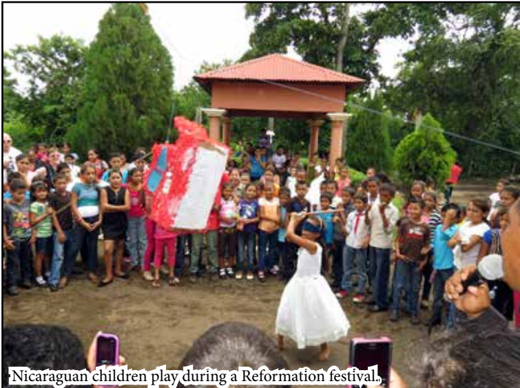
Nicaraguan children play during a Reformation festival.