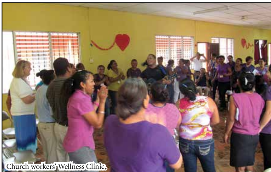
Church workers' Wellness Clinic.

Church Workers Wellness Clinic: LCC is developing a wellness clinic for pastors, deaconesses, and their families in Central America, to ensure that church workers are assisted holistically. This work is made possible by through an experienced team of pastors and physicians from LCC.