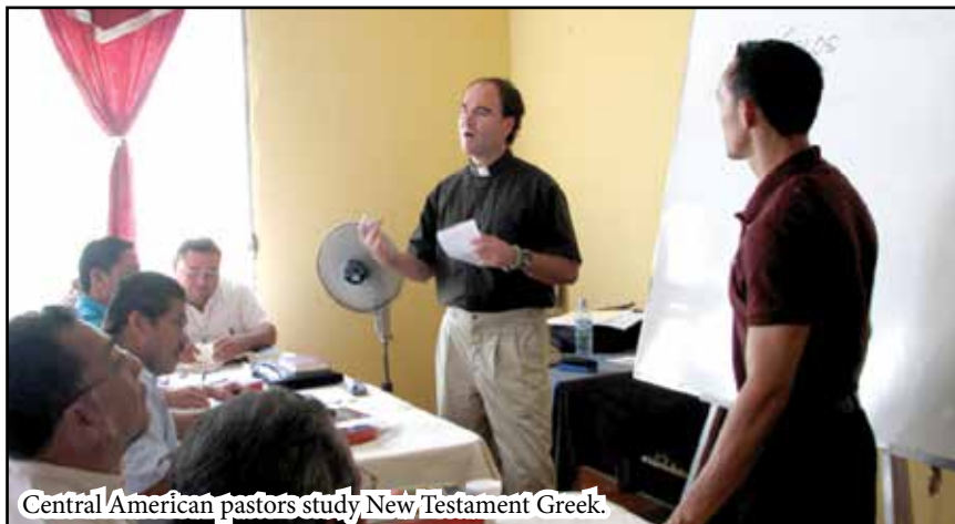
Central American pastors study New Testament Greek.

Greek Studies: Every year, Central America holds an annual seminar where pastors are learning the basics of New Testament Greek, thanks to instruction offered by pastors of Lutheran Church–Canada.