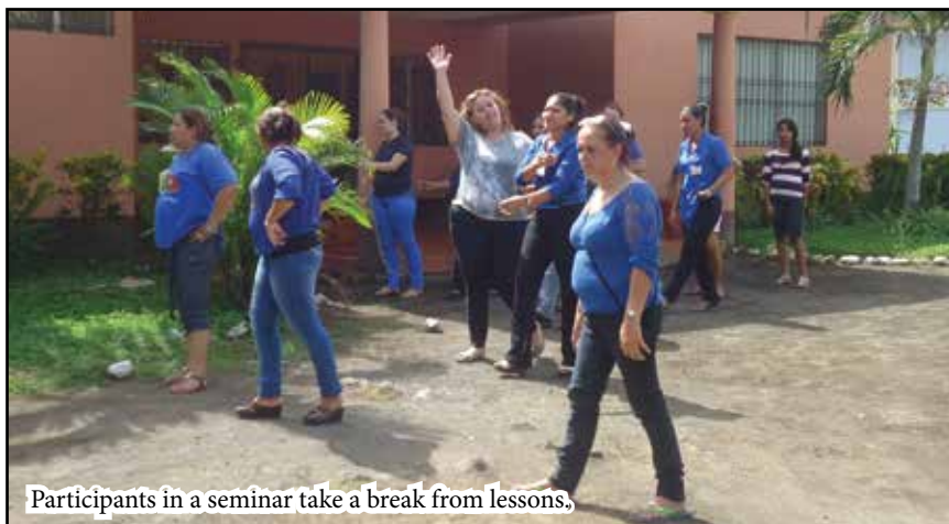
Participants in a seminar take a break from lessons.

Seminars for Deaconesses: Deaconesses in Cambodia and Central America benefit from seminars providing continuing instruction on biblical themes and family life education.