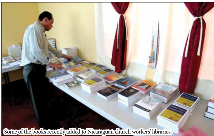
Some of the books recently added to Nicaraguan church workers' libraries.

Expanding Libraries: Through special donations from Lutheran Women's Missionary League-Canada, individuals, and families, the personal theological libraries of Nicaragua's church workers and the communal library at the Mission centre have been expanded in 2015.