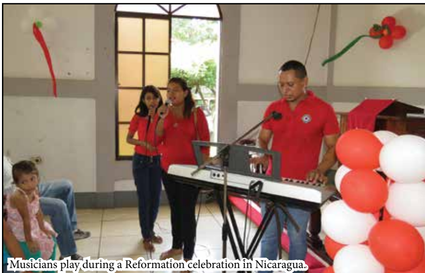
Musicians play during a Reformation celebration in Nicaragua.

Church Music: Thanks to financial support from Lutheran Church–Canada, congregations in Nicaragua now benefit from trained musicians to assist in leading singing and liturgy during worship.