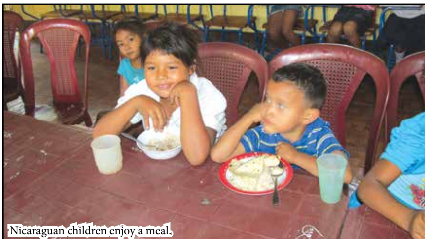
Nicaraguan children enjoy a meal.

Children Feeding Program: For about a $1.30 a day, Lutheran Church–Canada is providing children with a substantial meal in several feeding programs throughout Central America and Cambodia.