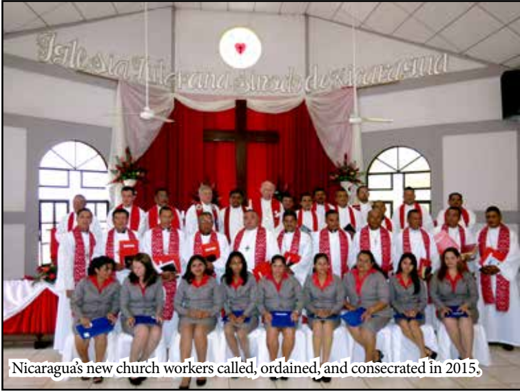
Nicaragua's new church workers called, ordained, and consecrated in 2015.

For all Nicaragua's newly ordained pastors and consecrated deaconesses who were installed in 2015.